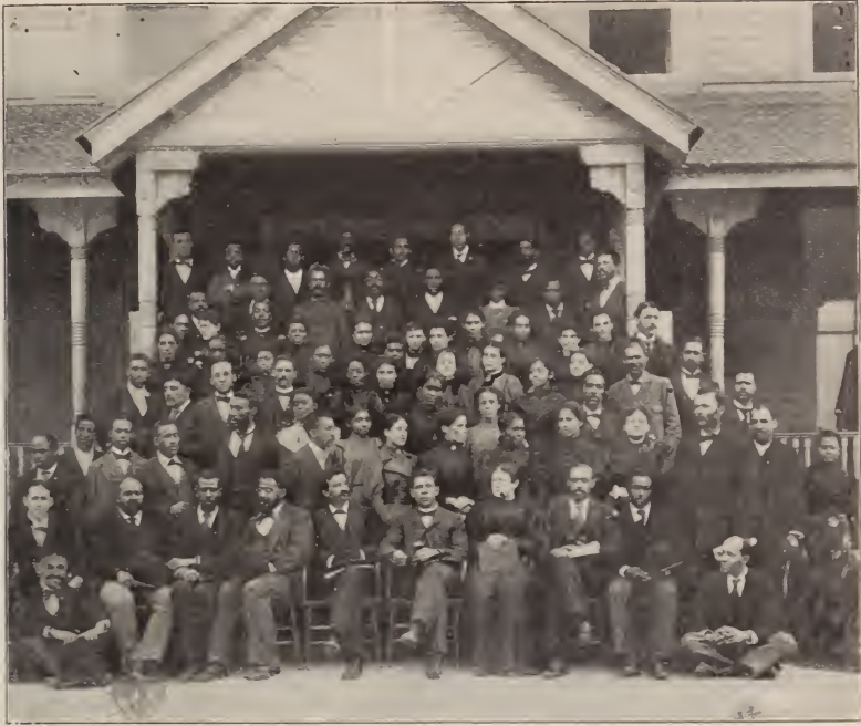
MOLDERS OF THE FUTURE OF THE AMERICAN NEGRO. The Faculty of the Tuskegee Normal and Industrial Institute.